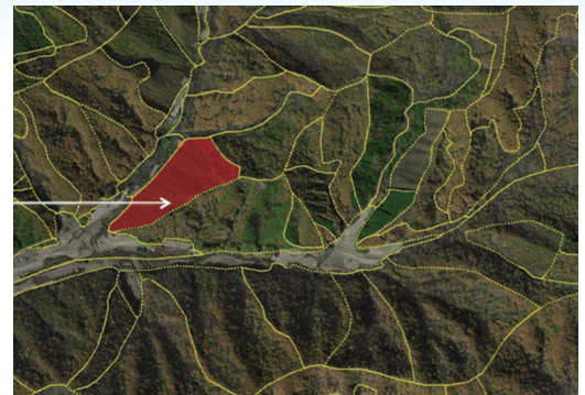
Forest patch map

SSTC's systems will help you to get all the information to be able to manage a disaster situation better, and even prevent it. We offer services that can predict the potential, including the time range and scale; make disaster monitoring more timely and accurate, and monitor almost every kind of disasters, especially floods, droughts and earthquakes. As well our services and products will help you in the assessment of disaster damage, planning and progress monitoring of post-disaster reconstruction .